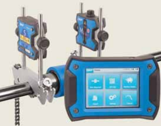
Shaft alignment tools